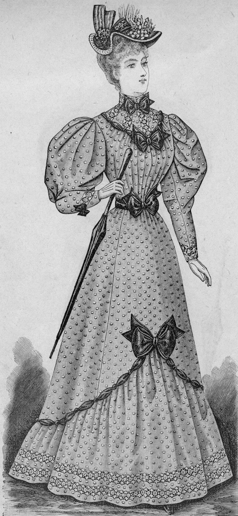
FIGURE NO. 264 K.—LADIES' FÊTE TOILETTE.—This consists of Ladies' Waist No. 7019 (copyright), price 1s. or 25 cents; and Five-Gored Skirt No. 7013 (copyright), price 1s. 3d. or 30 cents.

The waist is worn beneath the skirt and has a full outer body consisting of a back and fronts joined in under-arm and short shoulder seams and outlining a pointed yoke. The full back and fronts are gathered at the top, and the fullness at the lower edge is drawn well to the center and collected in two rows of shirring at the back and at each side of the closing, which