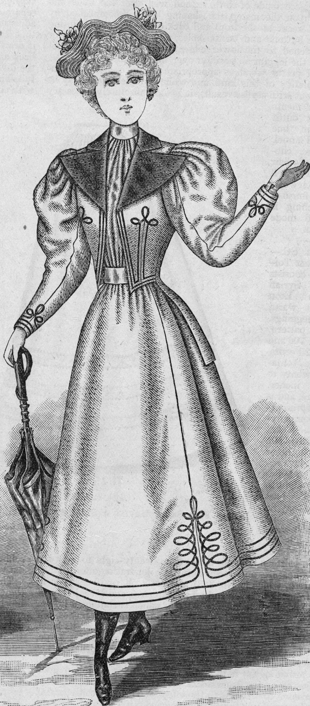
FIGURE No. 276 K.—MISSSES' OUTDOOR TOILETTE.—This consists of Misses Jacket No. 7007 (copyright), price 10d. or 20 cents; Four-Gored Skirt No. 7042 (copyright), price 10d. or 20 cents; and Waist No. 6345 (copyright), price 10d. or 20 cents.

single bust darts and the usual gores. The fulness at the front is drawn to the center in soft folds by gathers at the top and bottom;