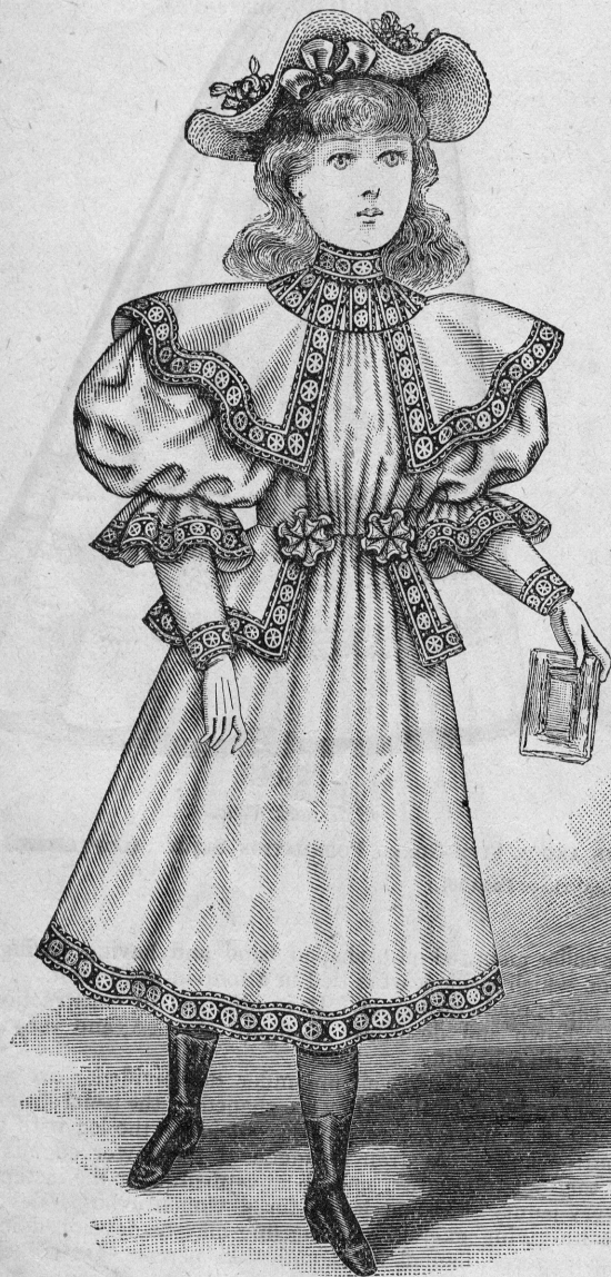
FIGURE No. 275 K.—GIRLS' DRESS.—This illustrates Pattern No. 7027 (copyright), price 1s. or 25 cents.

the fulness at the back is similarly disposed at each side of the center, which is made invisibly at the center; and under-arm goes to produce a becomingly smooth effect at the sides. The body lining exposed to shallow yoke depth is covered with a facing of cashmere.