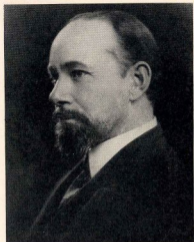
Sir Hubert Wilkins

This book sets forth the plans for the Polar submarine expedition—the "how" and the "why" of it. Further, it contains the record of Wilkins' own supremely picturesque life, sketching the highlights of a career perhaps unparalleled among modern explorers.