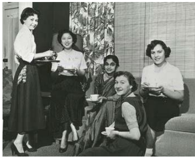
International Students at Zonta House, 1952

The Women's Self-Government Association, which replaced the Women's Council, provided the most important opportunity for extracurricular enrichment for women students in terms of leadership and organizing skills. All women belonged to the WSGA which had an executive committee and a system of self-government in each dormitory.