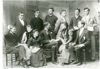
Lantern Staff 1892