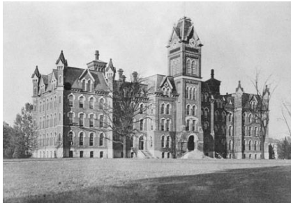
University Hall 1873

The Ohio State University opened its doors in 1873. The university's enabling act provided that it was to be open "to all persons over 14 years of age." At this time in U.S. history, women could not vote, in many states could not own property, and genuinely were second class citizens. They were expected to marry and have children. Education typically was not a high priority. 1