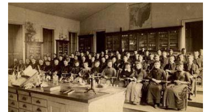
Chemistry Class 1888