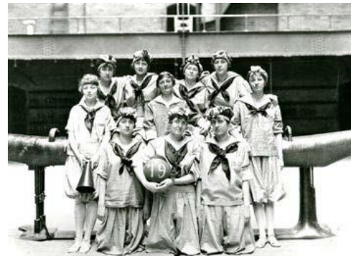
Girls Championship Basketball Team, 1919

The Deans of Women also continually worked on promoting more dormitories and facilities for women. "The girls of the university under the direction of the Women's Council have conducted a splendid campaign.