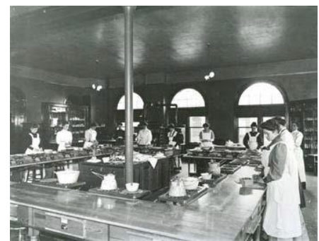
Domestic Science Class 1906