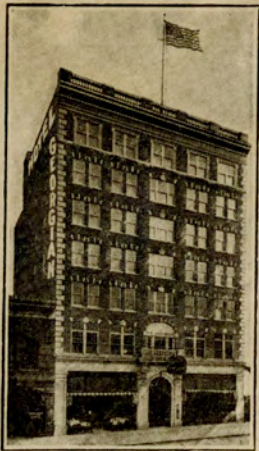
HOTEL GEORGIAN FOURTH AVENUE Pike & Union SEATTLE, U. S. A.