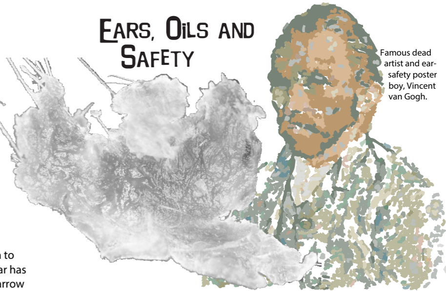
Famous dead artist and ear-safety poster boy, Vincent van Gogh.

Your ear canal is a self-cleaning system. When left alone, the ear canal oozes out thick oils, which then catch junk and schmutz. That hardens the oils into waxy chunks that will just fall out on their own. You should not stick a cotton swab into your ear. That would pack down the wax against the eardrum. It won't fall out, and you're in danger of hurting your eardrum – a very sensitive and delicate thing.