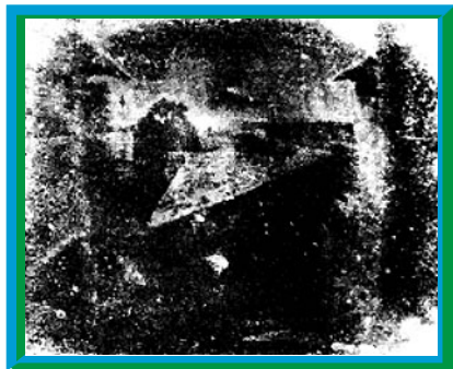
Niépce spent all of his money on his camera experiments and died flat broke.

WHAT TO DO: Find the big box at a supermarket. Tape the white paper inside like in the drawing. Cut a 1-inch-by-1-inch hole in the opposite side of the box and tape a piece of foil over it. Use the nail to punch a hole in the foil. Close the box and tape it all up. Tape down foil to seal the cracks. It is very important that no light at all get in the box - except through the little hole in the foil. Seal all corners and cracks. The darker the box is, the better this experiment works!