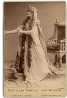
Photograph of Ellen Terry as Lady Macbeth in the 1888 Lyceum Theatre production of MACBETH.