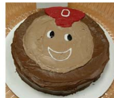
Best Buckeye Theme