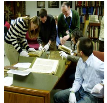
Ohio State students and faculty examine medieval manuscripts.