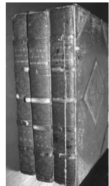
John Foxe's Actes and Monuments (1610).

To visit OSU's Foxe Digital Project: http://library.osu.edu/sites/dlib/foxe/index.html